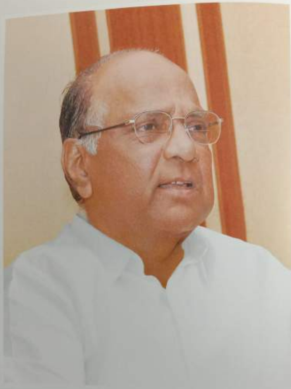
Padmavibhushan Hon'ble Sharad Pawar