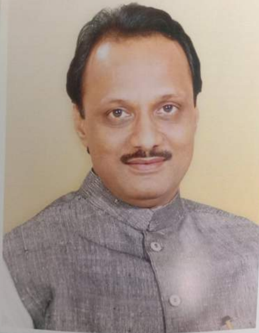
Honorable Ajit Pawar

President Pune District Education Association Deputy Chief Minister, Maharashtra State