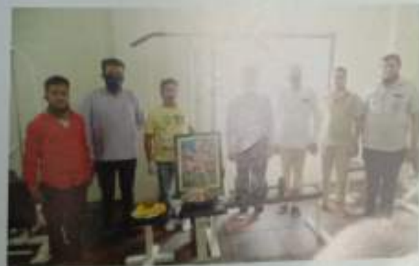
विज्ञान विभाग - दिवाली पूजा