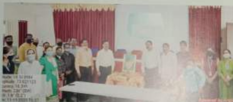
भाजी केंद्रिय शिक्षणमंत्री मौलाना आझाद यांच्या निमित्त अभिमान यामाये