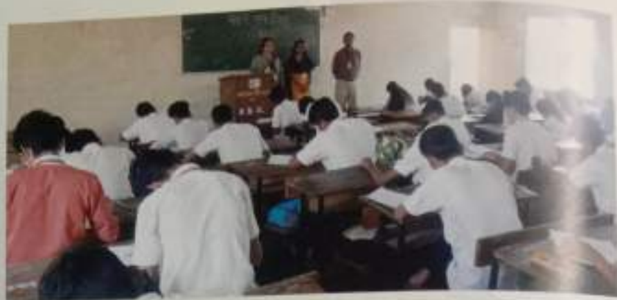
मराठी भाषा दिवस निमित्त विविध स्पर्धा