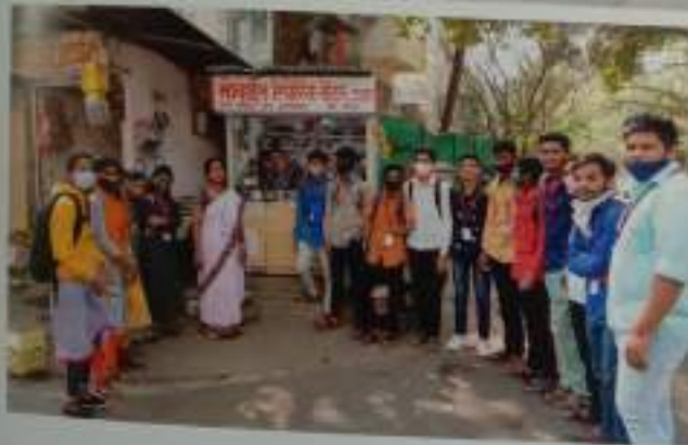
औद्योगिक भेट, मोबाईल रिपेअरिंग इलेक्ट्रॉनिक्स विभागालार्फे इ. १२ वी विद्यार्थी व प्राध्यापक