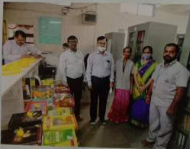
ग्रंथालय विभाग : दिपावली पूजन