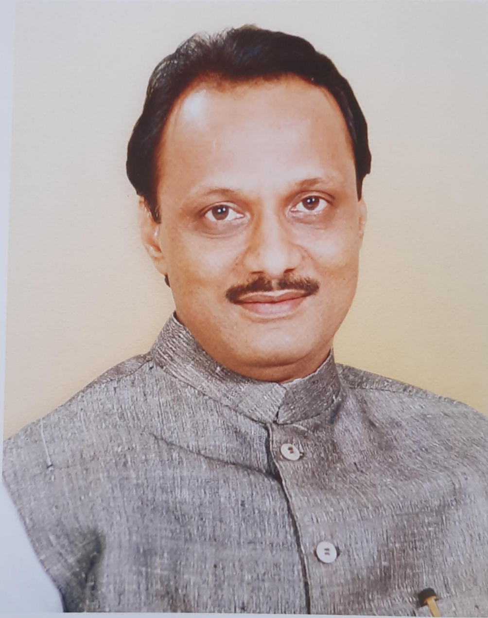
Honorable Ajit Pawar

President Pune District Education Association