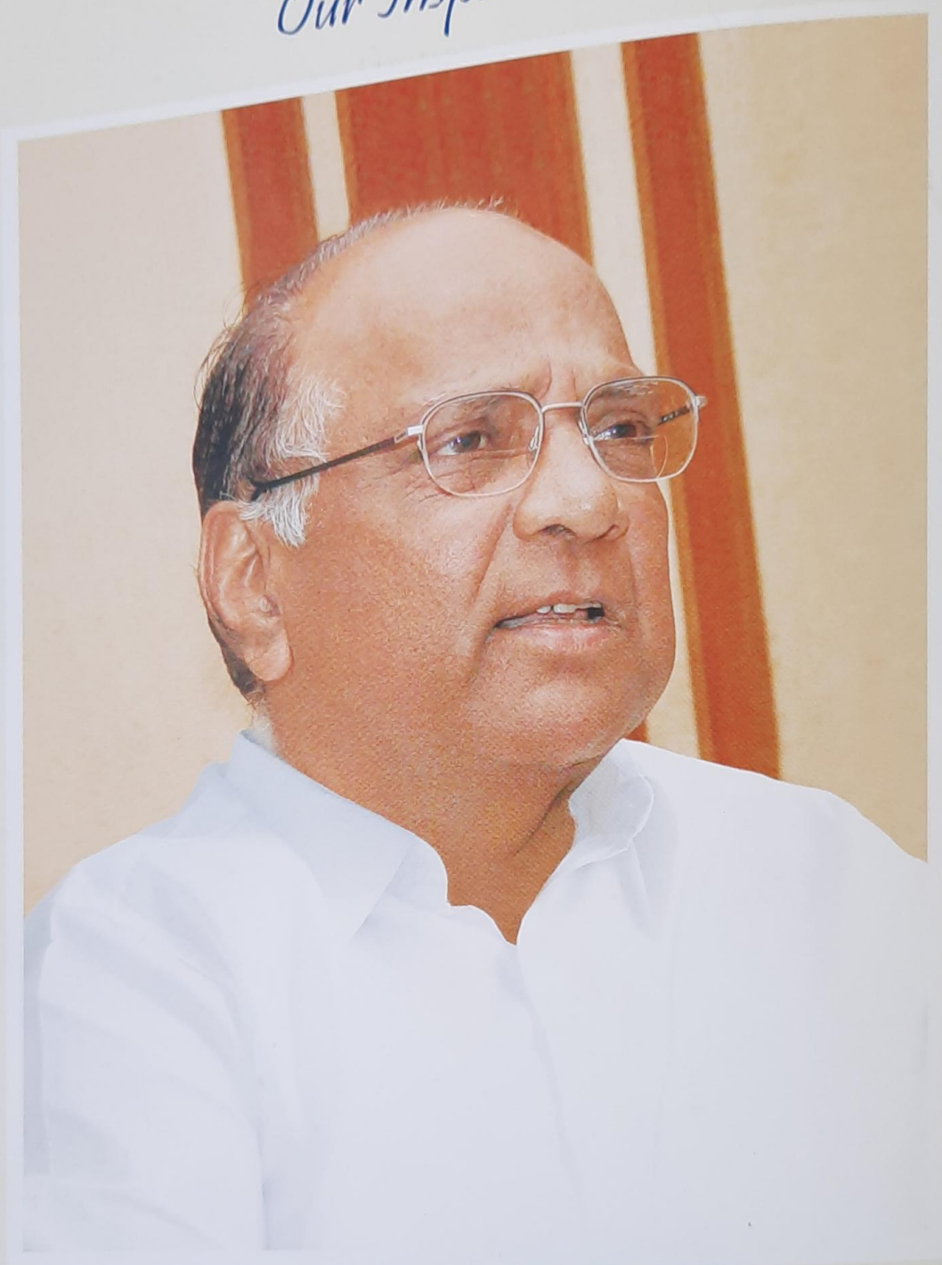
Padmavibhushan Hon'ble Sharad Pawar