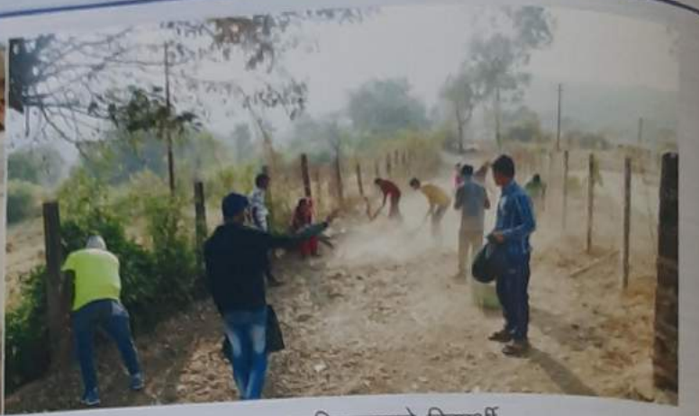
राष्ट्रीय सेवा योजना विशेष हिवाळी शिबीर पोमगाव येथे श्रमदान करताना महाविद्यालयाचे विद्यार्थी