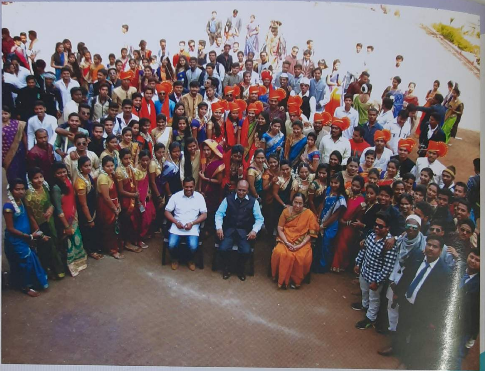
Pune District Education Association's MAMASAHEB MOHOL COLLEGE Erandwana, Pune