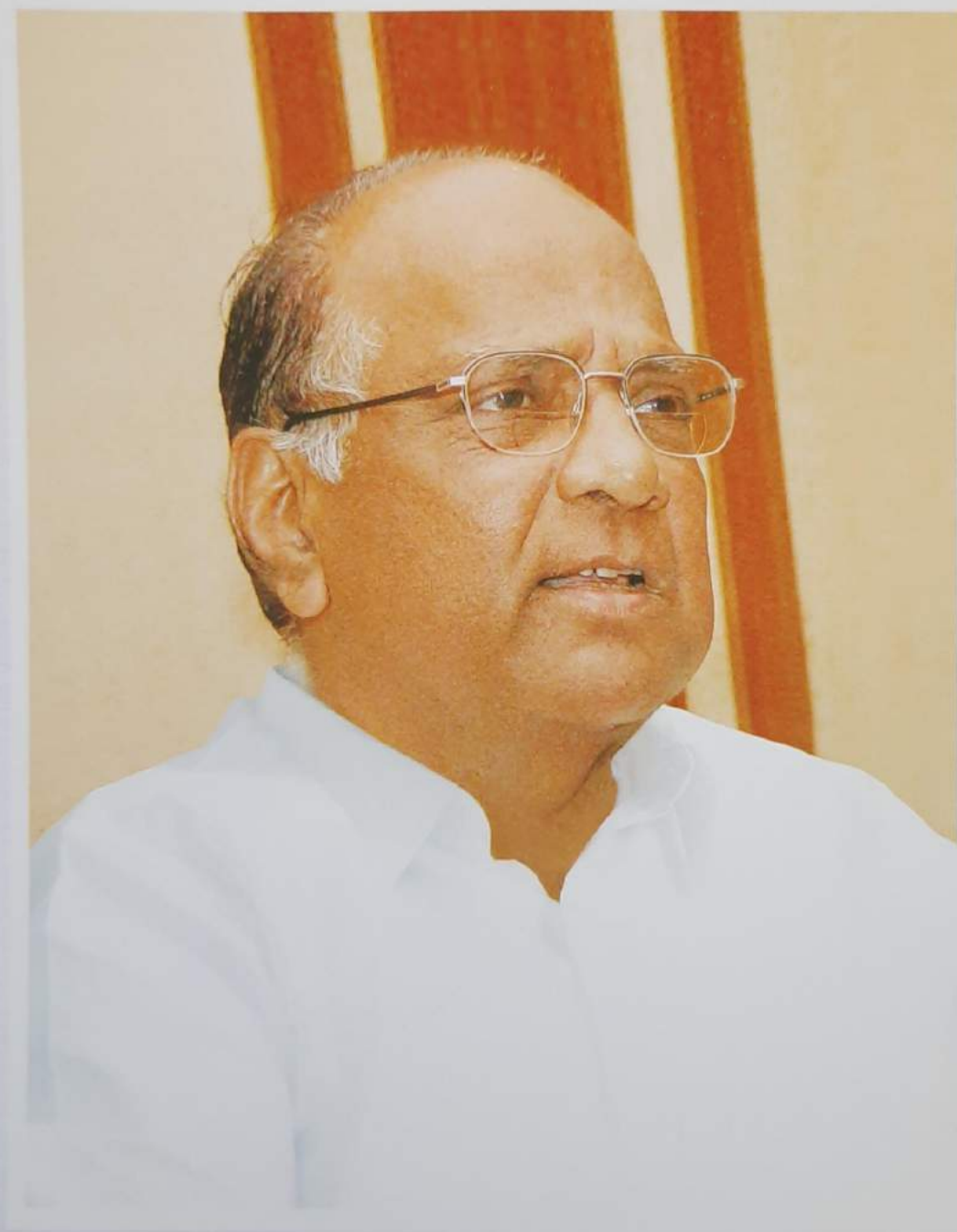
Padmavibhushan Sharad Pawar

Ex. Union Cabinet Minister Agriculture & Food Processing Industries Government of India