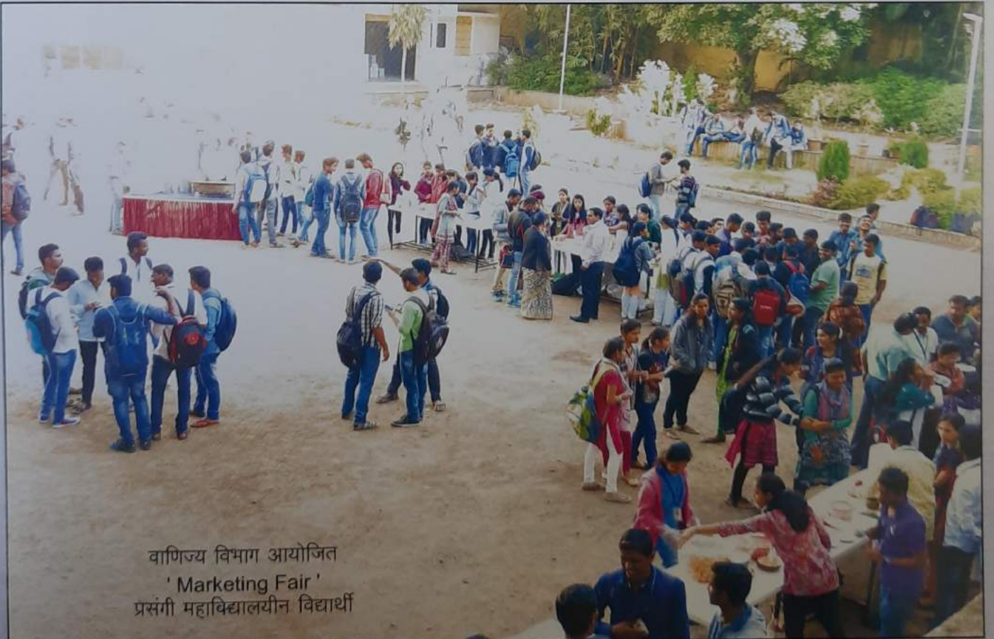
वाणिज्य विभाग आयोजित 'Marketing Fair' प्रसंगी महाविद्यालयीन विद्यार्थी