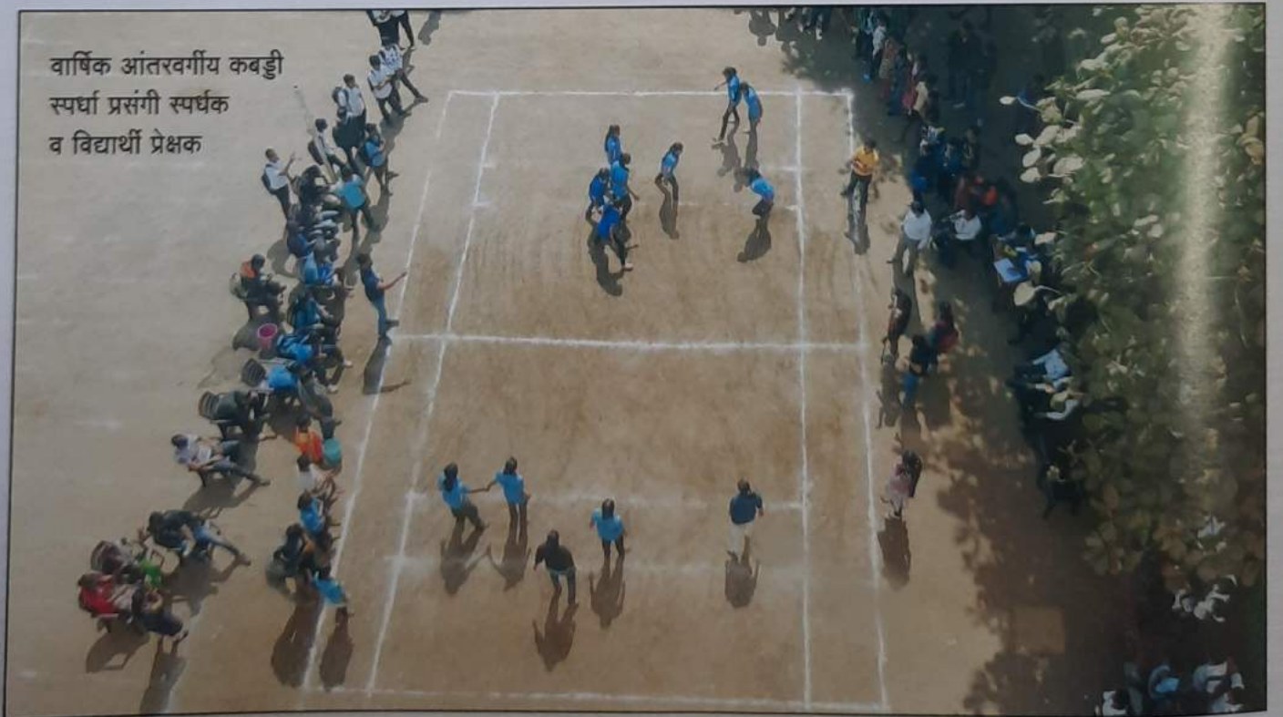
वार्षिक आंतरवर्गीय कबड्डी स्पर्धा प्रसंगी स्पर्धक व विद्यार्थी प्रेक्षक