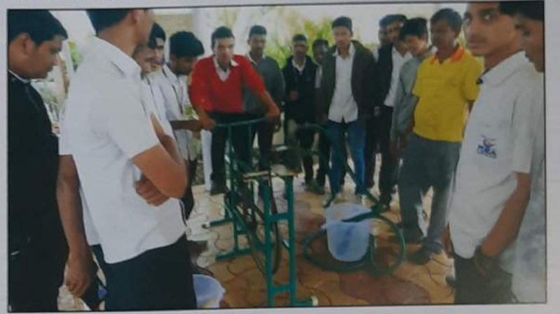
नाविन्यपूर्ण प्रकल्प सादर करताना एम.सी.व्ही.सी.चे विद्यार्थी