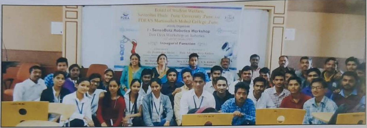
विद्यार्थी कल्याण मंडळ अंतर्गत दोन दिवसीय 'Robotic Workshop' प्रसंगी मार्गदर्शक व उपस्थित विद्यार्थी