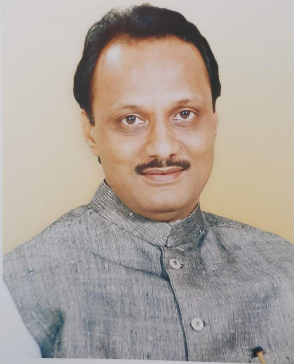
Honorable Ajit Pawar

President Pune District Education Association