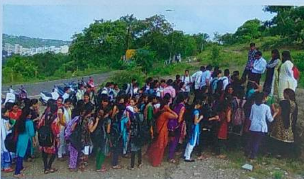
Clean Pune - Plastic free Pune