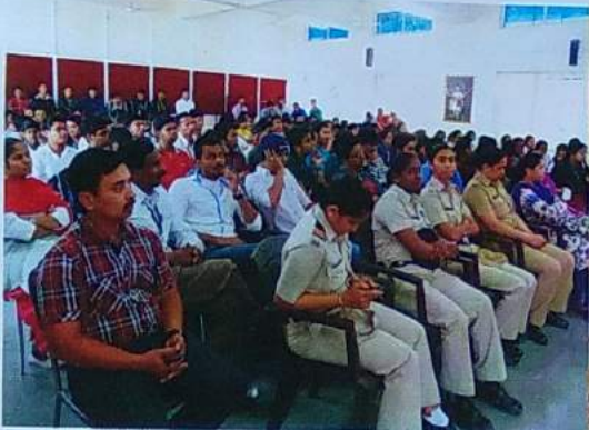
Women Empowerment Programme