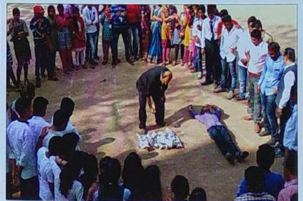
Disaster Management Workshop