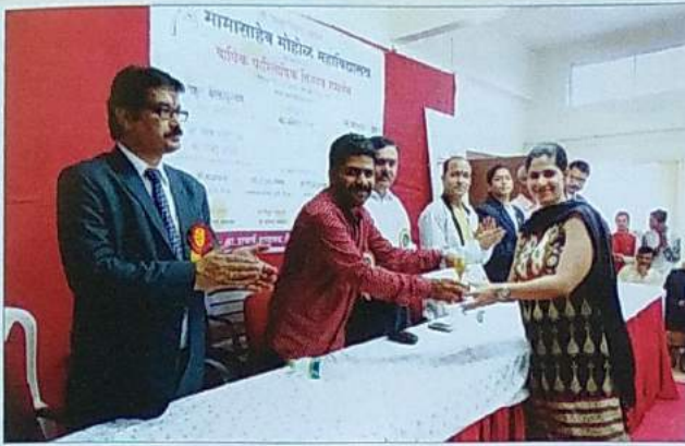
Annual Prize Distribution