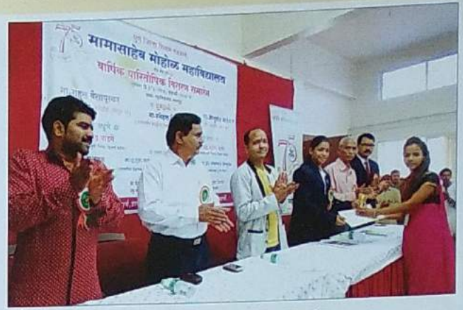
Annual Prize Distribution