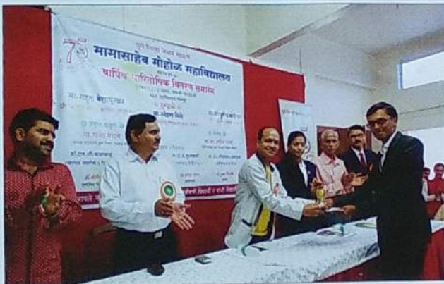
Annual Prize Distribution