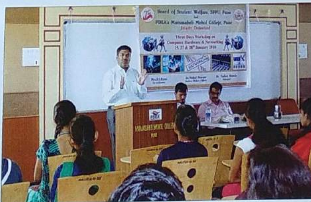
Computer Hardware & Networking Workshop