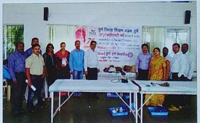
NSS - Blood Donation Camp