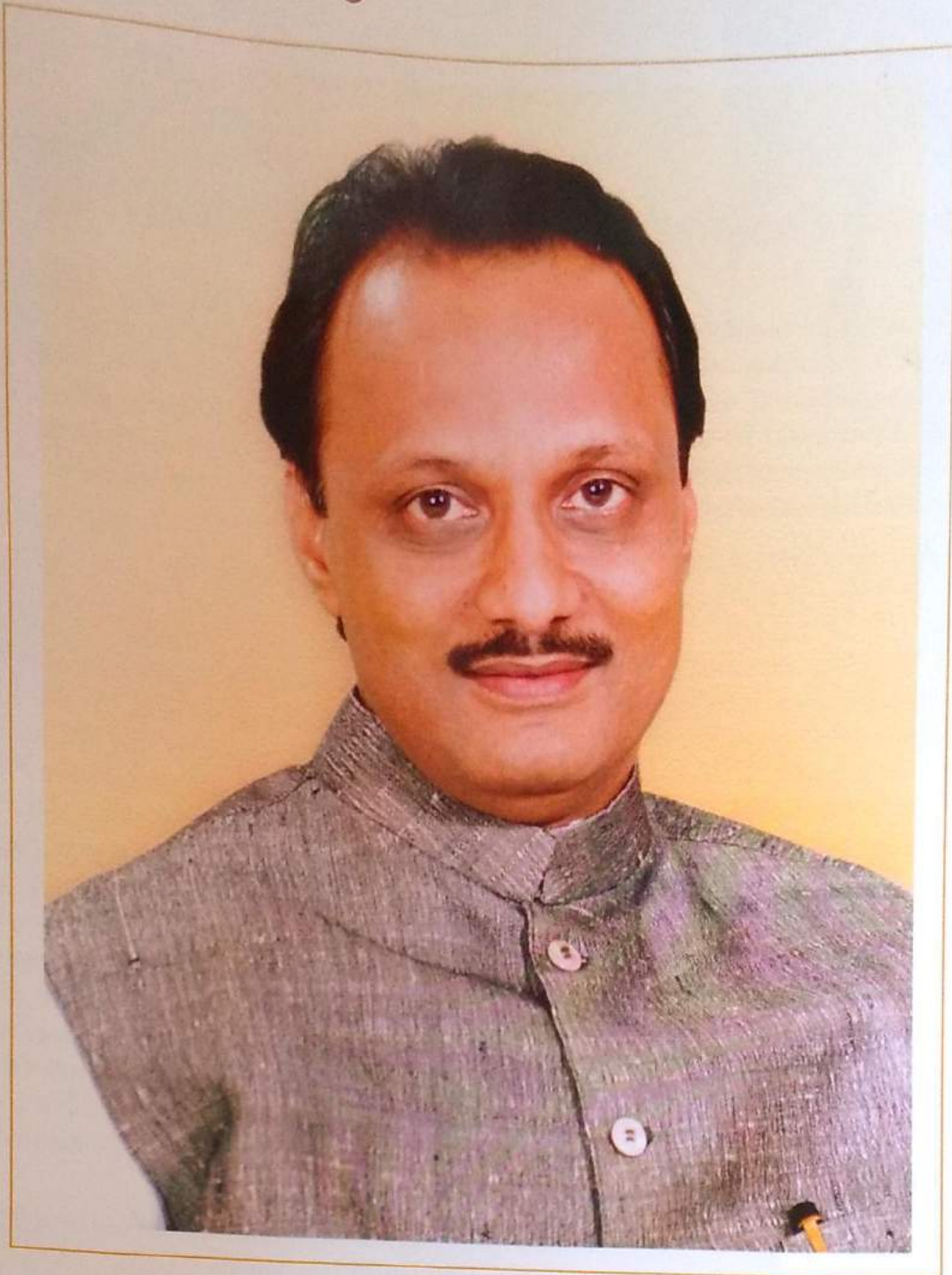
Hon'ble Ajit Pawar

Ex. Deputy Chief Minister, Maharashtra State President, Pune District Education Association