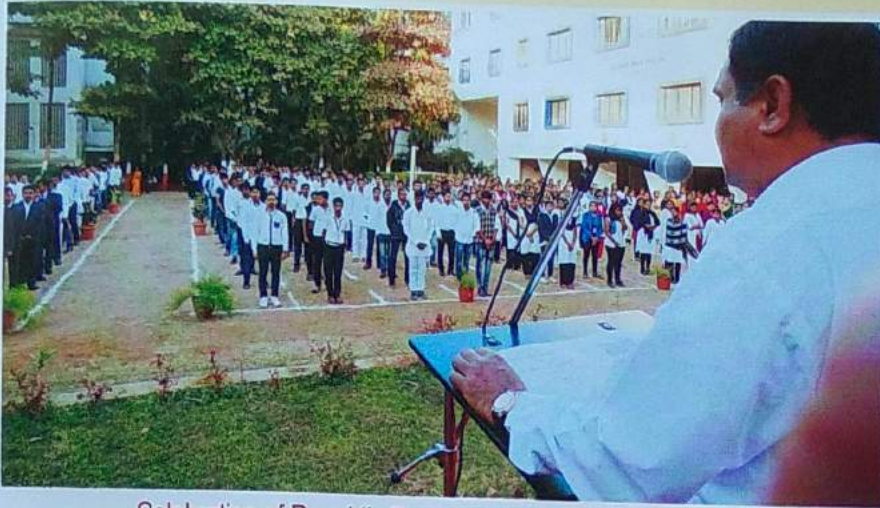
Celebration of Republic Day - Hon. Adv. Sandeep Kadam