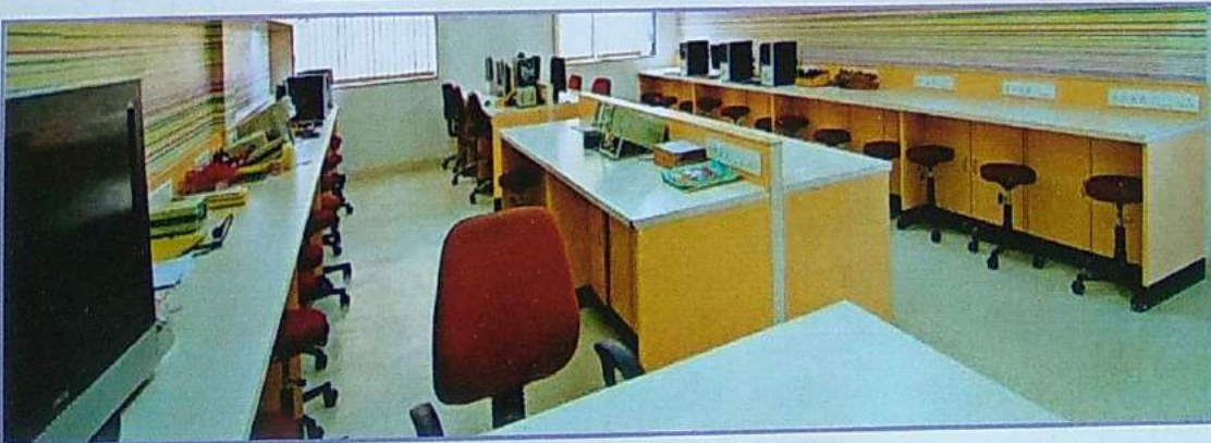
महाविद्यालयाची सर्वसोयींनी युक्त इलेक्ट्रॉनिक लॅब