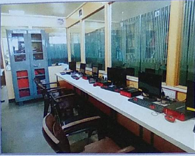
महाविद्यालयाची अद्यावत ई-लायब्ररी