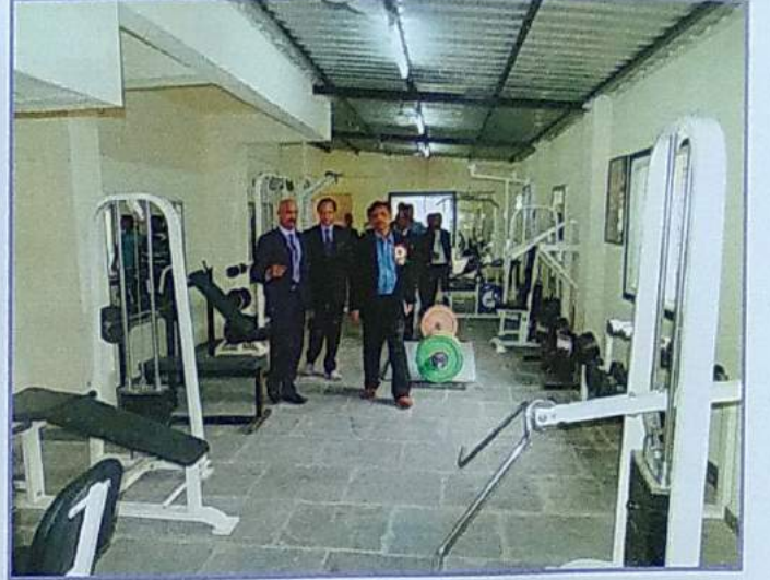
महाविद्यालयाचा अद्यावत जिमखाना विभाग