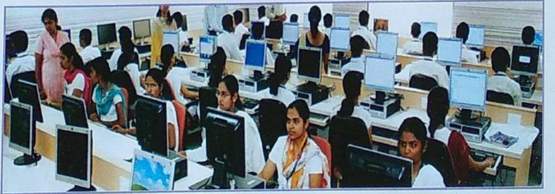
महाविद्यालयाची सर्वसोयींनी युक्त संगणक लॅब