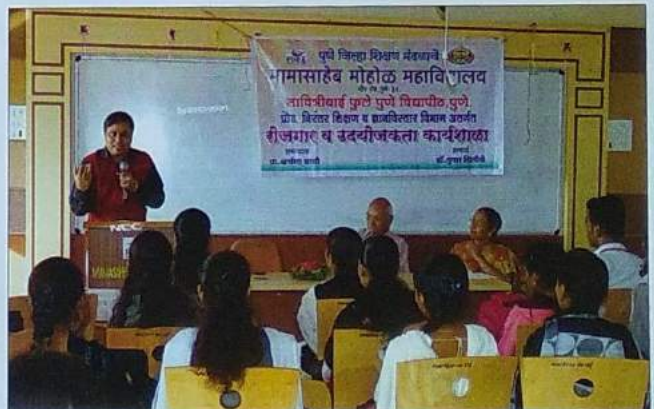
Entrepreneurship Development workshop