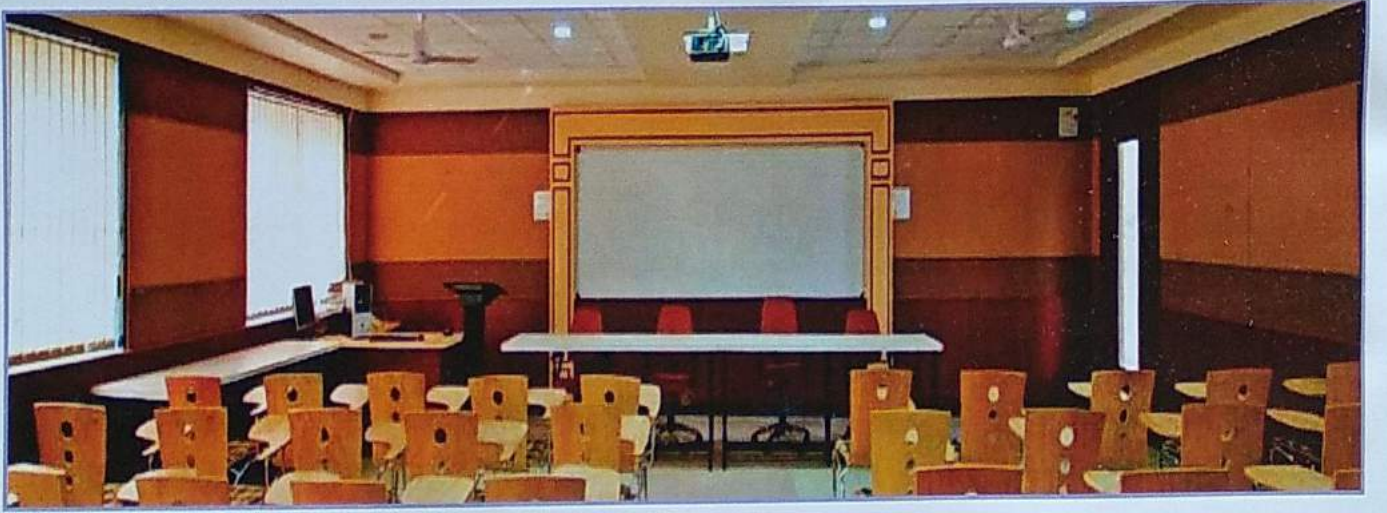
महाविद्यालयाची अद्यावत ए.व्ही.रूम