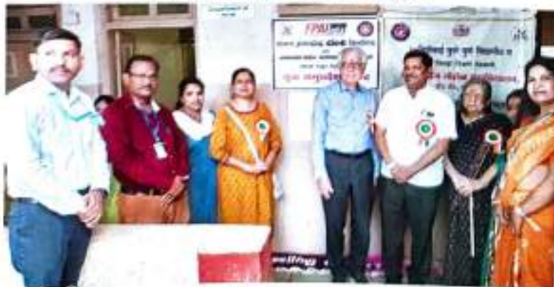
युवा समुपदेशन केंद्र उद्घाटन प्रसंगी