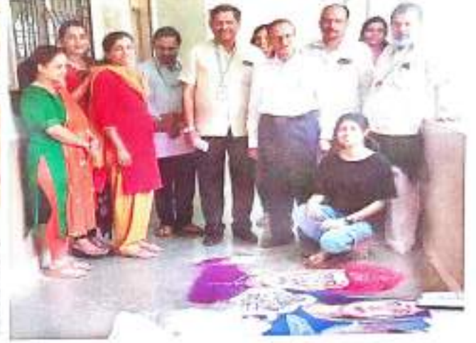
महात्मा फुले जयंती निमित्त आयोजित रांगोळी स्पर्धा