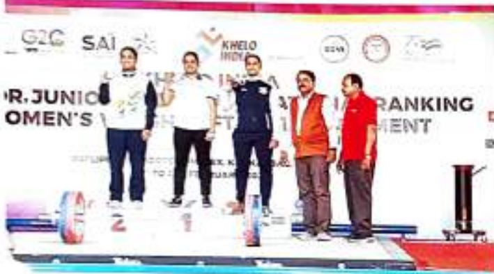
खेलो इंडिया राष्ट्रीय स्पर्धा वेटलिफ्टिंग शैष्य पदक