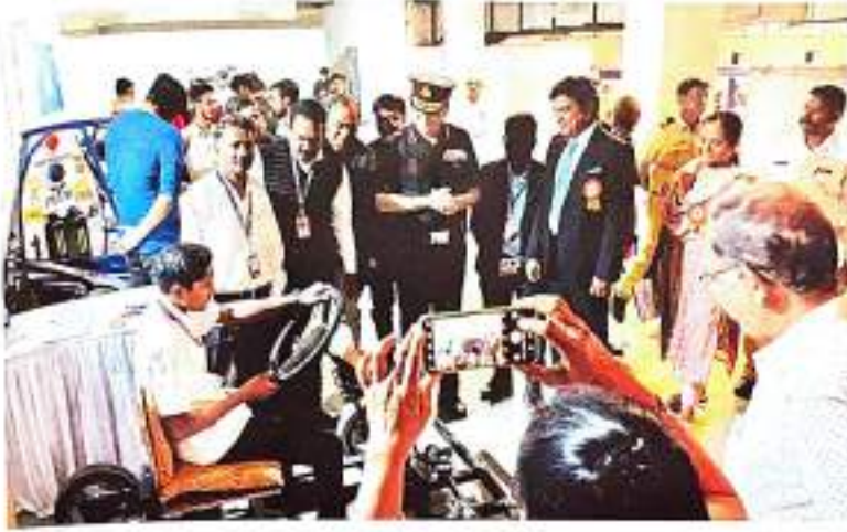
ऑटो एक्सपोजे मध्ये प्रकल्प सादरीकरण