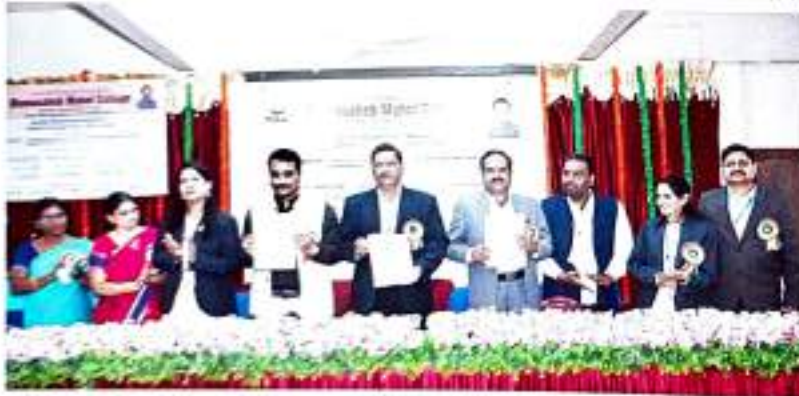
NEP-2020 राष्ट्रीय चर्चासत्राचे उद्घाटन