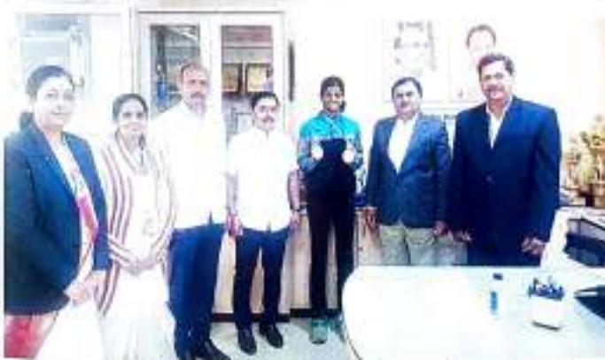
आंतरविद्यापीठ स्पर्धेमध्ये १०० मी, २०० मी. सुवर्णपदक