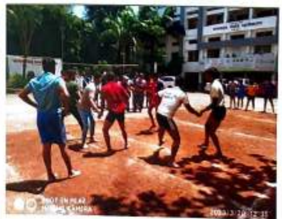
आंतरवर्गीय वार्षिक क्रीडा स्पर्धा