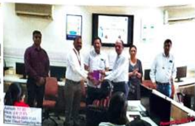
Workshop on Cloud Computing : Computer Science Department