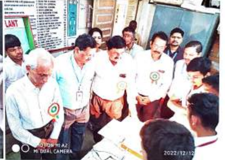
विज्ञान प्रदर्शनात सहभागी विद्यार्थी