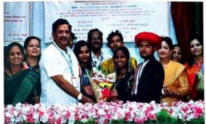
जिल्हास्तरीय एकांकिका स्पर्धा विजेत्या संघाचे कौतुक करताना प्राचार्य