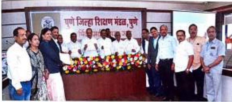
NEP 2020 या विषयावरील राष्ट्रीय चर्चासत्रामधील संशोधित लेखांचे प्रकाशन करताना संस्था अध्यक्ष मा.अजितदादा पवार साहेब व संस्था पदाधिकारी