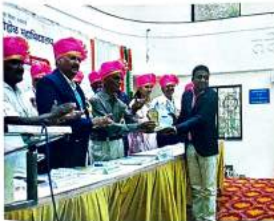
वार्षिक पारितोषिक वितरण समारंभ