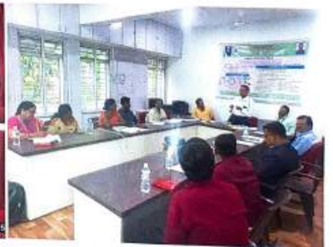
लिकेज कमिटीत मार्गदर्शन करताना संस्थेचे उपसचिव