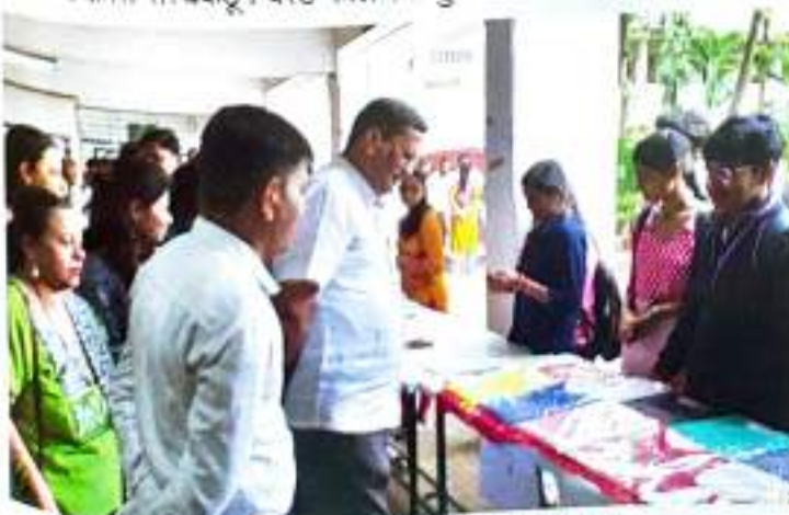
उद्योजकता विकास कार्यक्रम (एमएमसी बझार)