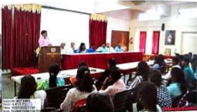
विद्यार्थी संवाद : नविन प्रवेश व स्वागत