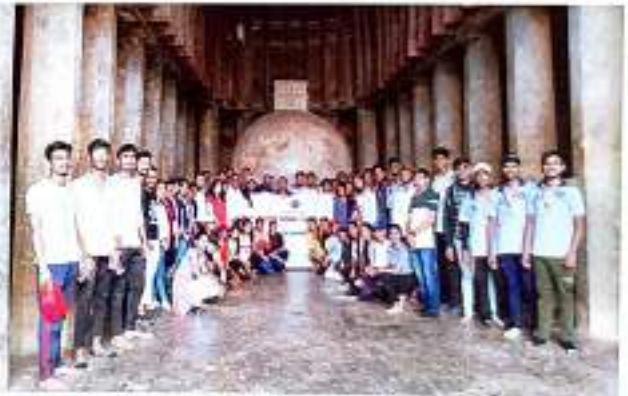
शैक्षणिक सहल, भाजे लेणी, लोणावळा