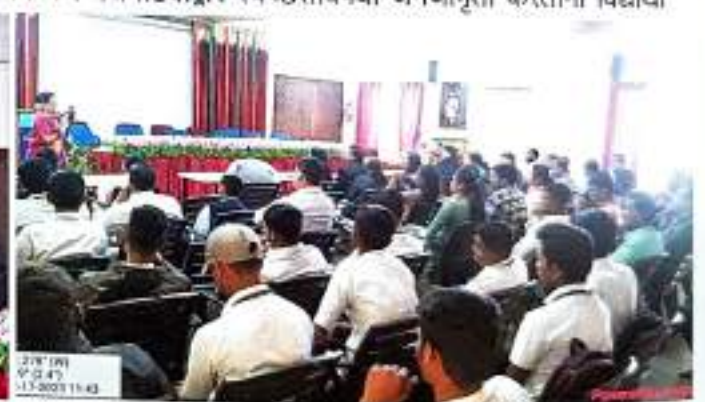
NEP-2020 राष्ट्रीय चर्चासत्रात मार्गदर्शन करताना