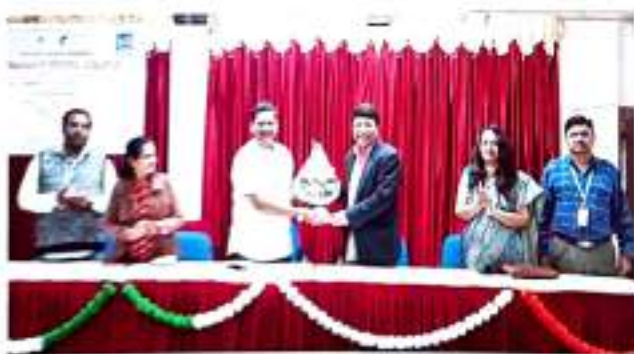
'Intellectual Property Right' कार्यशाळा