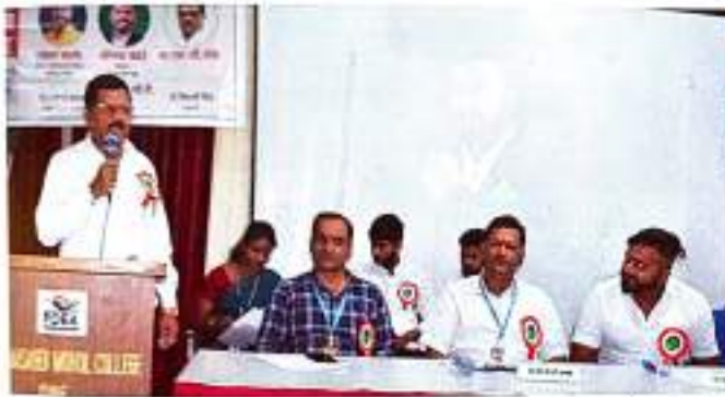
उद्योजक आपल्या भेटीला कार्यक्रम