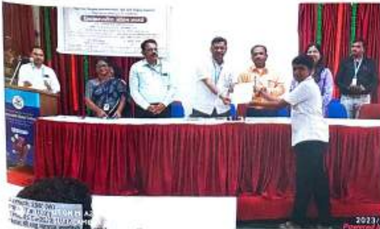
इ. ११ वी च्या विद्यार्थ्यांचा यश संपादन केल्याबद्दल सत्कार