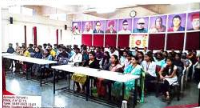
Student Induction Programme