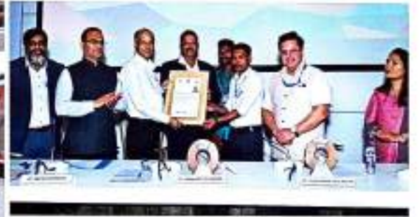
पुणे जिल्हा निवडणूक आयोगाकडून मतदार नोंदणी बद्दल महाविद्यालयास पारितोषिक