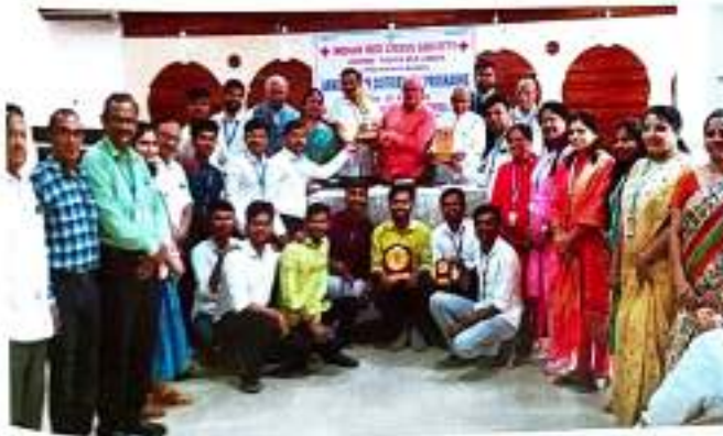
२६ क्रॉस संस्थेकडून बेस्ट कॉलेजचा पुरस्कार स्वीकारताना