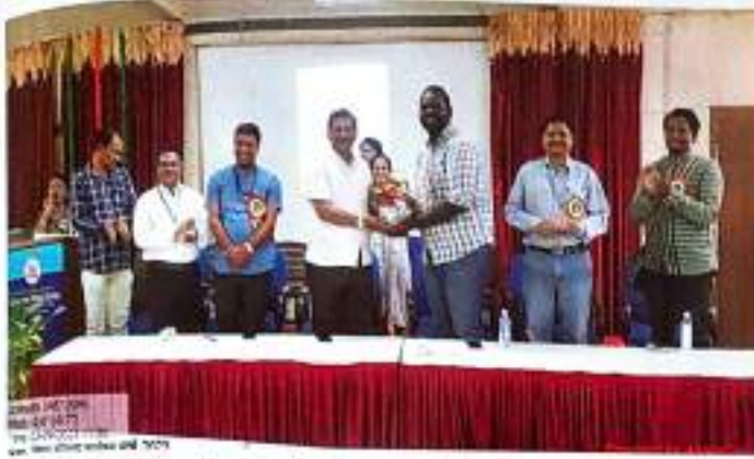
लेखन कौशल्य कार्यशाळा प्रसंगी