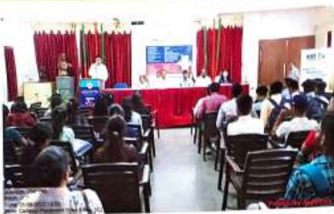
Placement drive with NIIT foundation