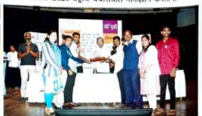
पुणे मनपा आयोजित स्वच्छता मोहित स्पर्धेमध्ये मा.पालकमंत्री यांच्याकडून तृतीय क्रमांकाचा पुरस्कार स्विकारताना