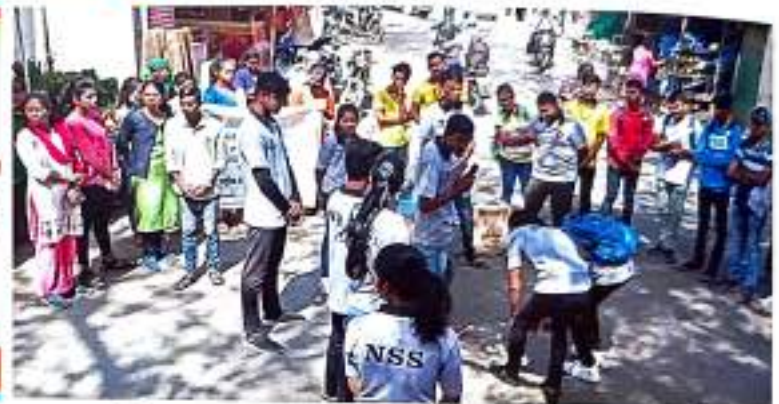
बावधन येथे पथनाट्याद्वारे स्वच्छतेविषयी जनजागृती करताना विद्यार्थी