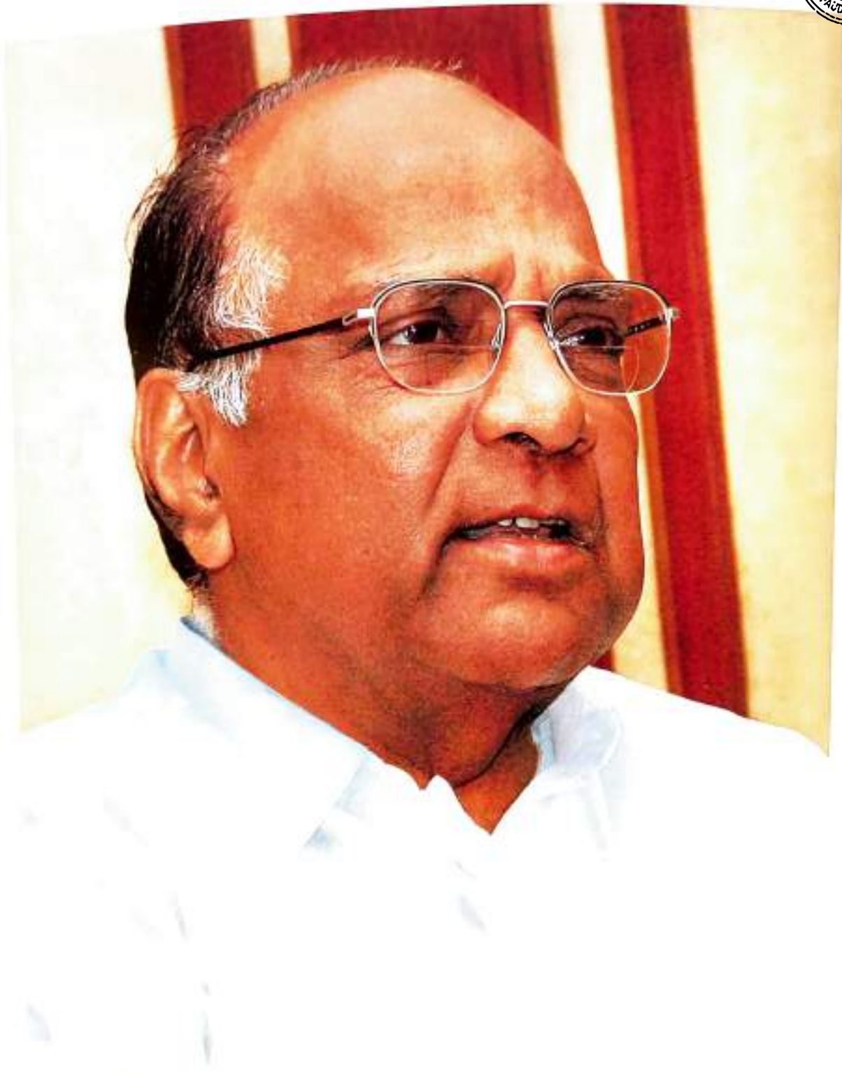
Padmavibhushan Hon'ble Sharad Pawar Ex. Union Cabinet Minister Agriculture & Food Processing Industries Government of India