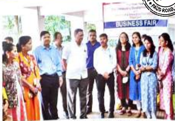
महाविद्यालयात आयोजित बिझनेस फेअरचे उद्घाटन