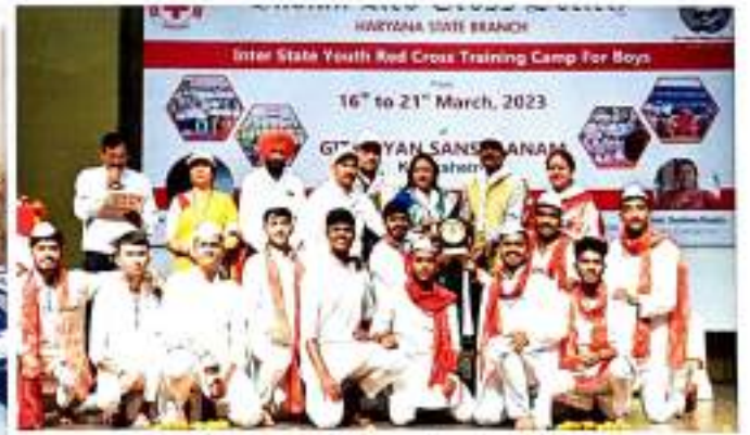
कुरुक्षेत्र, हरियाणा येथे रेड क्रॉस संस्थेकडून बेस्ट कॉलेज पुरस्कार स्विकारताना