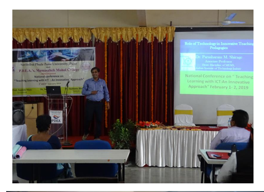
Session I: "Role of technology in an Innovative Teaching Pedagogies"