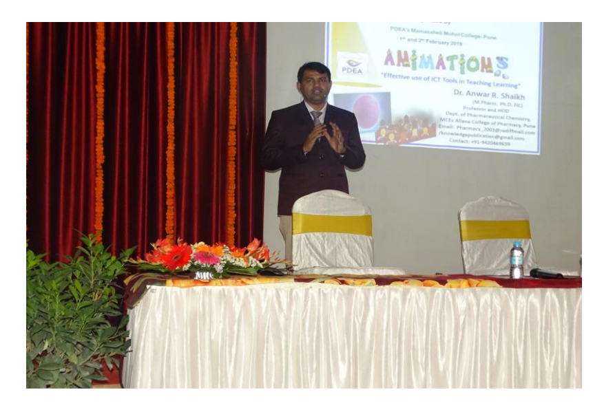
Session II: "Teaching Learning with Animation